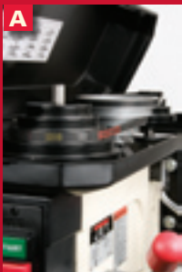
Poly-V belt drive system